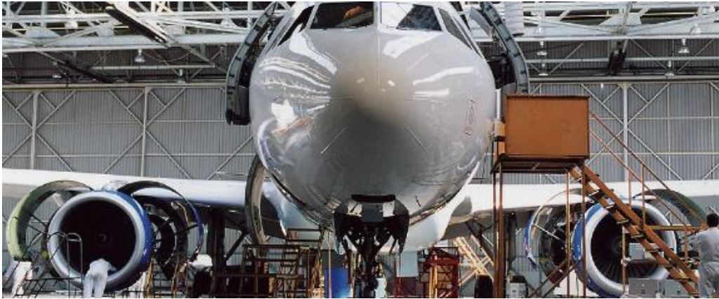
Airbus A320 Major Inspection